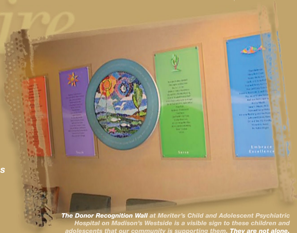
The Donor Recognition Wall at Meriter's Child and Adolescent Psychiatric Hospital on Madison's Westside is a visible sign to these children and adolescents that our community is supporting them. They are not alone.

Max Pohle Dental Clinic is Making a Difference