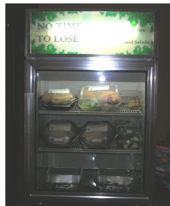
Grab 'n Go cooler!