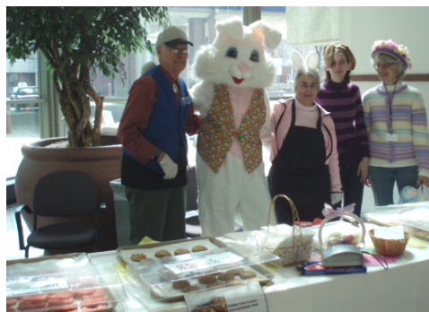
Easter Bunny & friends visited us for our holiday sale on April 8th!